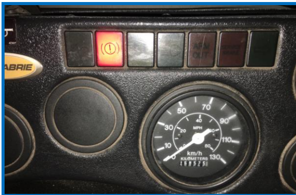
Earlier Lights- ELL00402